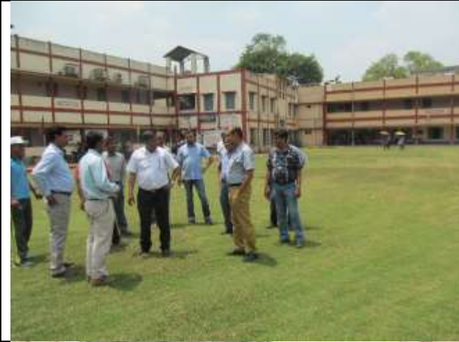
FRONT SIDE OF 6 RIVERSIDE ROAD CAMPUS