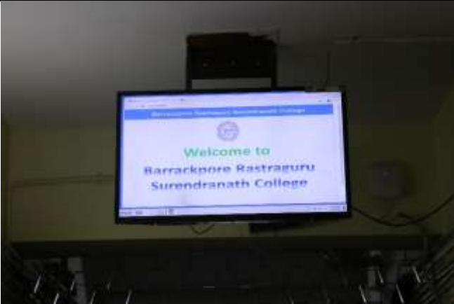
LED NOTICE DISPLAY BOARD IN BOTH CAMPUSES