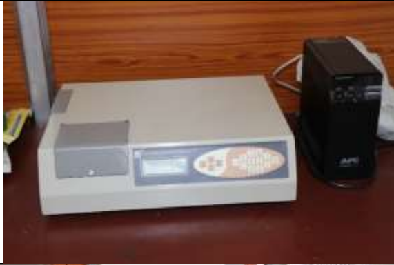
SPECTROPHOTOMETER AT FOOD AND NUTRITION DEPARTMENT