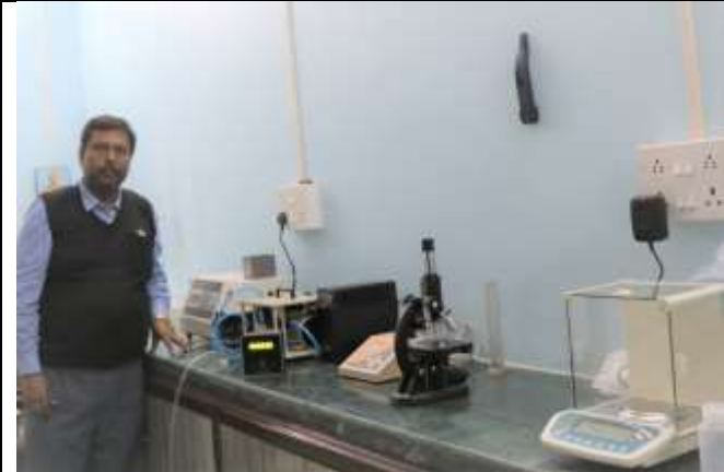
NUMBER OF WELL EQUIPED LABORATYRY