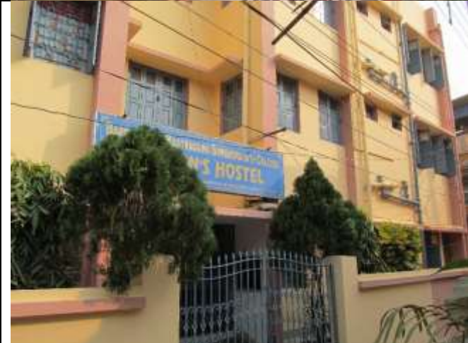
GIRLS HOSTEL CAPACITY = 50 STUDENTS