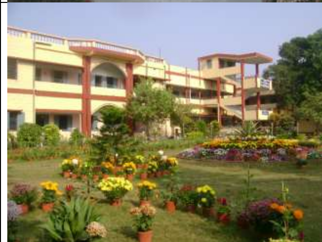
BACK SIDE OF 6 RIVERSIDE CAMPUS