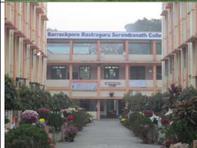
FRONT SIDE OF 85 MIDDLE ROAD CAMPUS