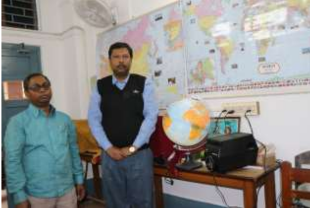
MAPS, LIGHTING GLOBE , PAXISCOPE AT ECONOMICS DEPARTMENTS