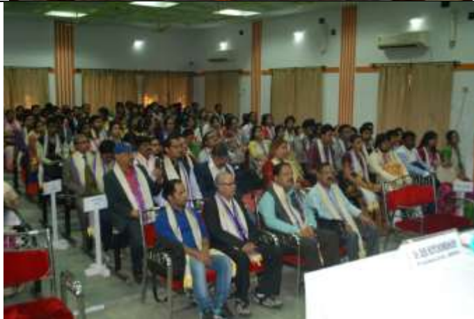
PG COMMENCEMENT AT BIBHUTIBHUSHAN HALL