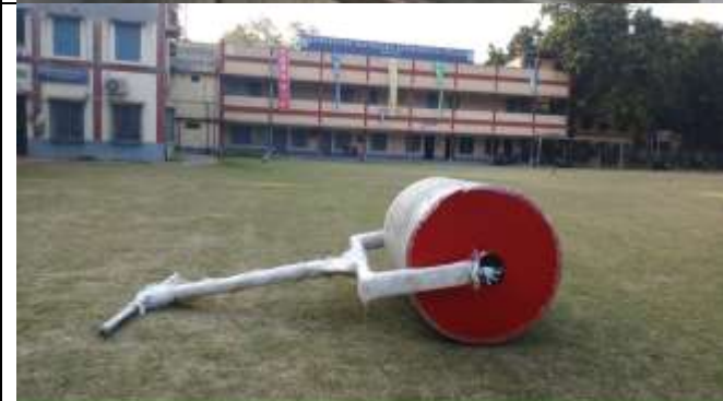
COLLEGE PLAY GROUND