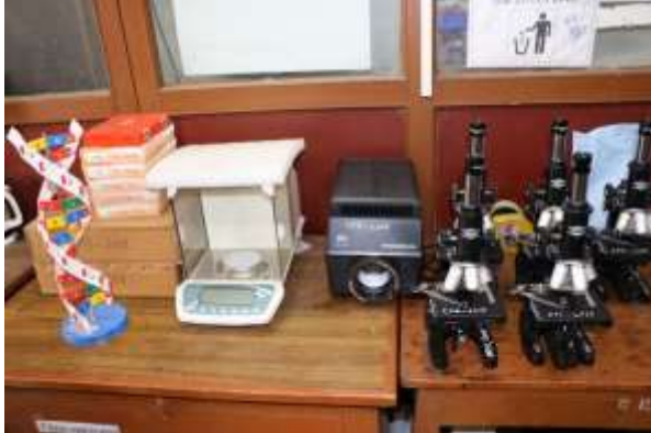
EQUIPMENTS AND TEACHING AIDS AT DEPARTMENT OF BOTANY