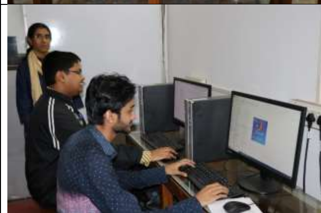
COMPUTER LAB AT 85 MIDDLE ROAD