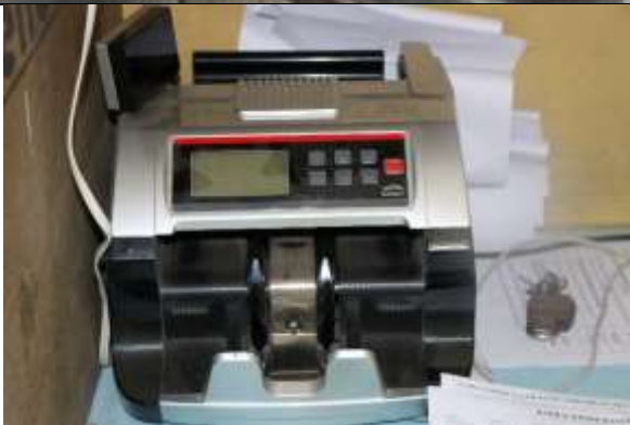
VALUE COUNTER AT COLLEGE CASH COUNTER