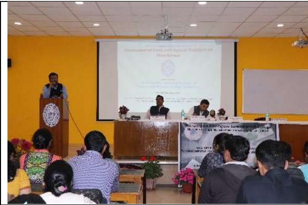
SMART CLASS ROOM(AC) CUM SEMINAR HALL ROOM NO 226 AT 85, MIDDLE ROAD CAMPUS CAPACITY = 250 PERSONS