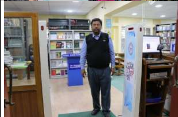
OPEN ACCESS CENTRAL LIBRARY WITH RFID SYSTEM AT 85, MIDDLE ROAD CAMPUS