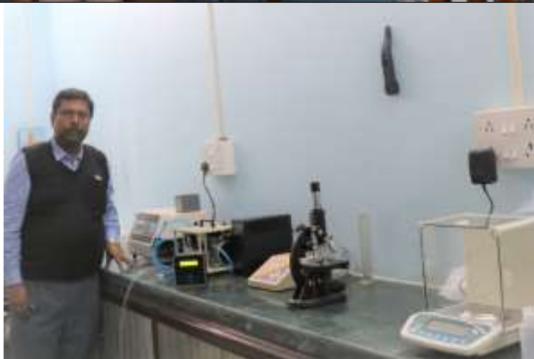
ENVIRONMENT LAB INSTRUMENTS FOR GREEN AUDIT