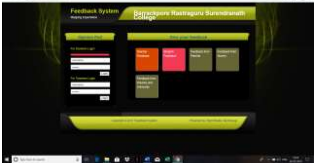
ONLINE FEEDBACK SYSTEM https://www.feedback.brsnc.in/