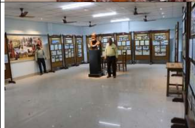
MUSEUM ON BARRACKPORE AND NORTH 24 PARGANA DISTRICT, WB AT 85, MIDDLE ROAD CAMPUS