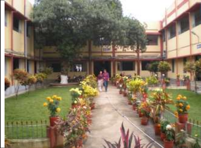
MIDDLE PORTION OF 6 RIVERSIDE CAMPUS