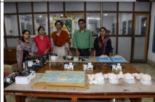
PSYCHOLOGY LABORATORY AT 85, MIDDLE ROAD CAMPUS