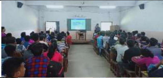
A CLASS ROOM AT 6 RIVERSIDE ROAD CAMPUS