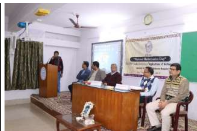
ROOM NO 202, SEMINAR HALL CUM SMART CLASS ROOM AT 85 MIDDLE ROAD CAMPUS