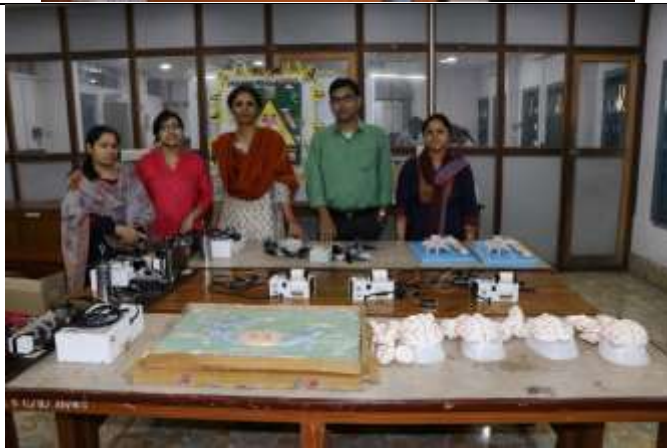
EQUIPMENTS AND TEACHING AIDS AT DEPARTMENT OF PSYCHOLOGY