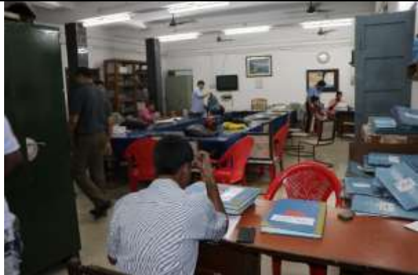
TEACHERS LOUNGE AT 85 MIDDLE RD CAMPUS