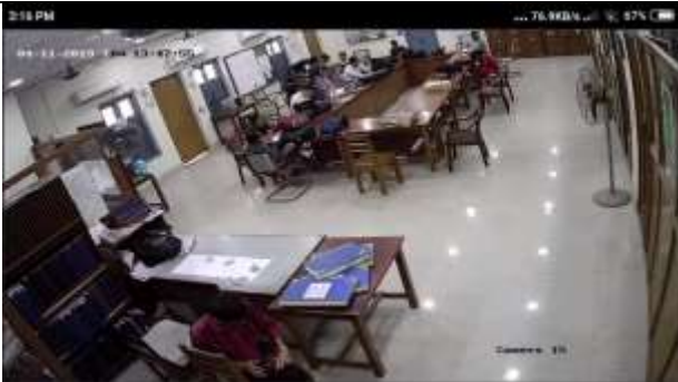
COLLEGE GARDEN TEACHERS LOUNGE AT 6 RIVERSIDE RD CAMPUS