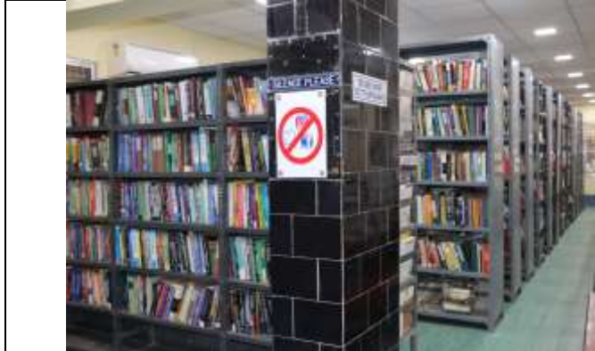
FEW LIBRARY BOOK RACKS