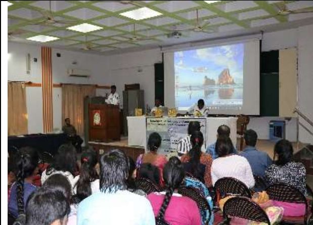
BIBHUTI BHUSHAN HALL (AC) AT 6 RIVERSIDE ROAD CAMPUS, CAPACITY = 220 PERSONS